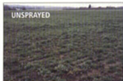
Unsprayed—contaminants are growing

lbs. actual N per year adequate in most situations. Pure Gold thrives at a mowing height of 1 1/2 to 3". Irrigation rates are considerably less than with ryegrass or bluegrass.